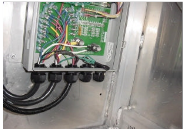
Proper Drip Loops, GOOD Job!